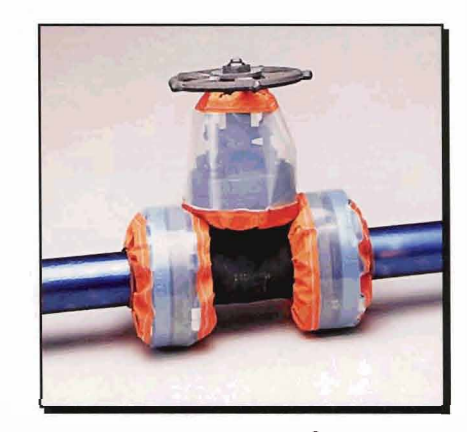
VUE-GARD<sup>®</sup> BONNET SHIELD