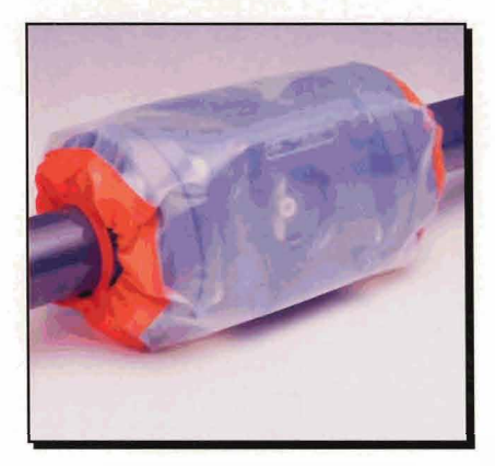
VUE-GARD<sup>®</sup> SHIELD FOR FLOW INDICATOR