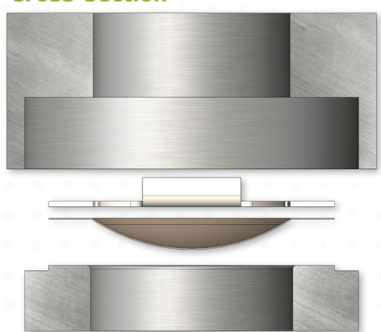
Three pieces welded into ONE